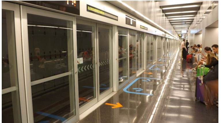
Barcelona Airport Metro – Platform

With the recent opening of the new metro line, travelling to and from the city centre has become that bit more convenient. More options means that you can reach your destination in no time.