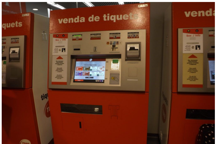
Barcelona Airport Metro – Buy Tickets

Group travel is naturally safer, however pickpockets work on Barcelona's metro and trains. It is important that you keep a close eye on your belongings.