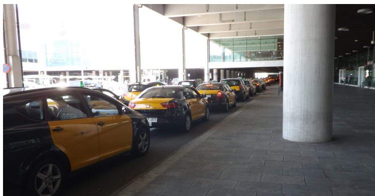
Airport taxis in Barcelona

Traveling into the city by taxi is ideal for a quick transfer. If you are in a rush and want to get to your destination and avoid the busy airport crowds, hiring a taxi is the best option.