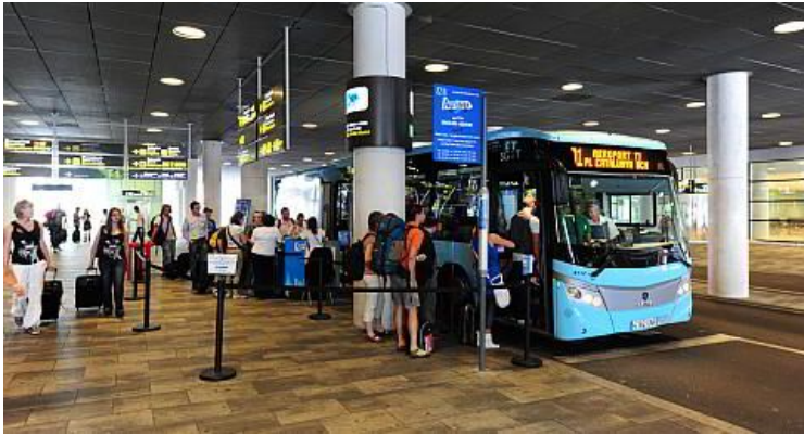
Aerobus from Terminal 1

There are three available buses from the airport to the city centre: The number 46, the night buses (N16/N17) and the quick and convenient aerobus. If you land at terminal 1, you can catch the number 46 and the two night buses at the same stand located outside the arrivals gates. The aerobus is also located outside the arrivals.