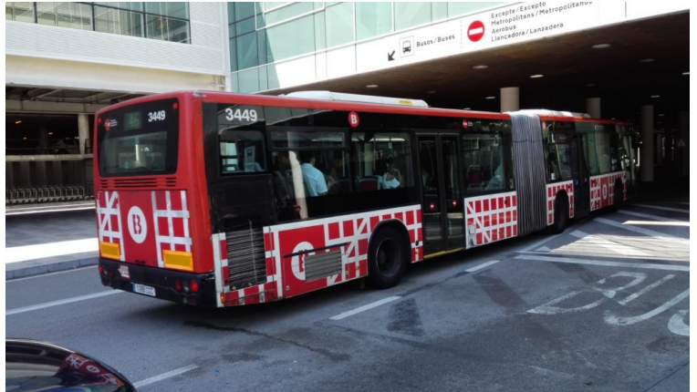
Number 46 bus

Barcelona offers a selection of means of travel from the airport to the city centre. Moreover, buses run 24 hours a day, 7 days a week.