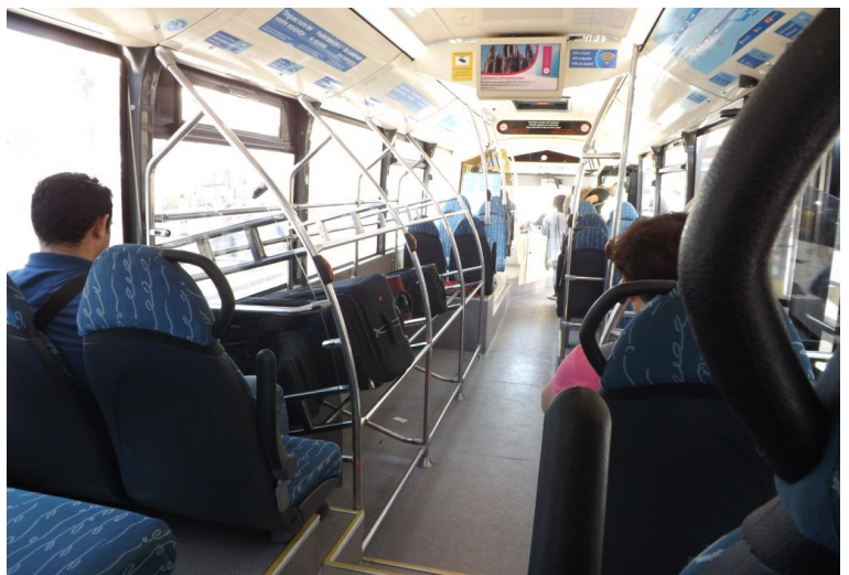
Aerobus – Inside Photo

When travelling in a group, the buses are naturally safer. However, if you travel after midnight or if you are travelling solo, it is advised to take a taxi.