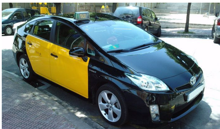
Taxi in Barcelona

We believe that when taking a taxi, you allow yourself a sense of safety. Using public transport can be quite risky and the taxis and taxi ranks in Barcelona are very safe.