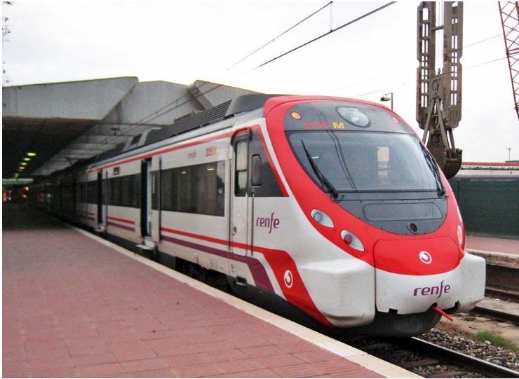
The RENFE train from Terminal 1

The train is located at terminal 1. The train station is connected to the airport via an overpass.